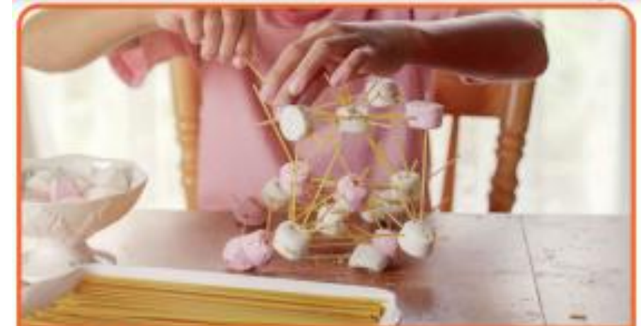
There are variety of ways to assemble a frame structure .