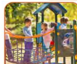
recreational land Land which has buildings providing fun activities.