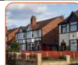
residential land Land used for houses and apartment blocks.