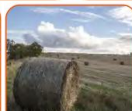
agricultural land Land used for farming, cattle and crops.