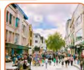
commercial land Land used for buildings aimed at making money.