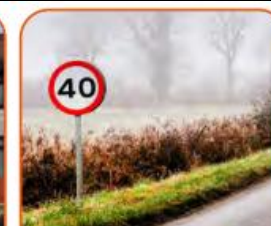
transportation A way of getting something from one place to another.