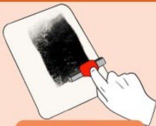
Step 1 Ink a flat surface.