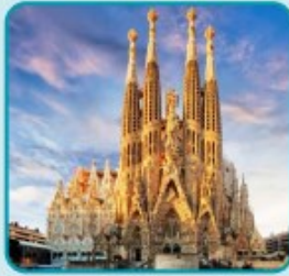
La Sagrada Família, Barcelona (Antoni Gaudi)