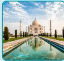
Taj Mahal, India (Ustad Ahmad Lahori)