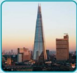
The Shard, London (Renzo Piano)