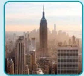
Empire State building, New York City (Shreve, Lamb & Harmon)