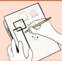
Step 3 Draw your design on the paper pressing firmly.