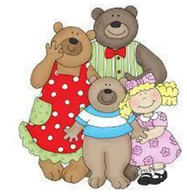
Eric Coates: "The Three Bears: A phantasy"