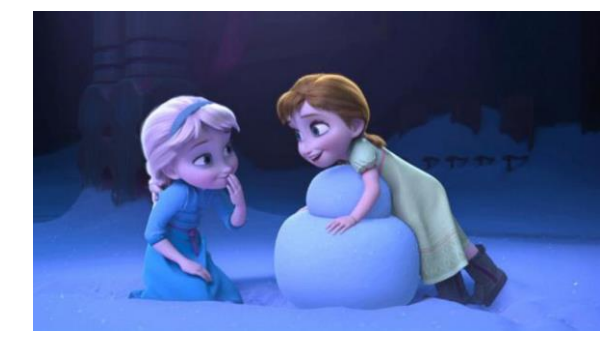
Frozen: "Do you want to build a snowman?"