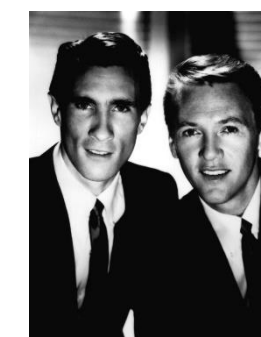
Righteous Brothers - Unchained Melody.