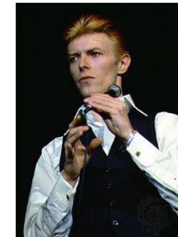
David Bowie - Space Oddity