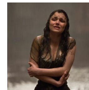
Samantha Barks - On my Own