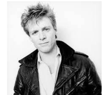
Bryan Adams - Everything I do.