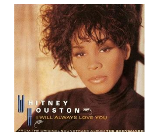
Whitney Houston - I will always love you.