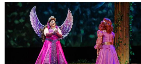
The Magic Flute (Opera - Mozart)