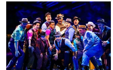
Guys and Dolls (Film Musical)