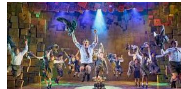
Matilda (Book Musical)