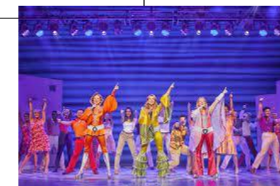
Dancing Queen (ABBA jukebox)