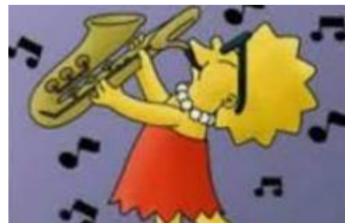
Moanin' Lisa Blues - The Simpsons