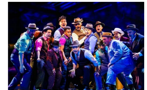
Guys and Dolls (Film Musical)