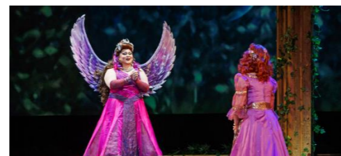
The Magic Flute (Opera - Mozart)