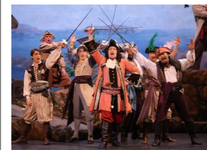
Pirates of Penzance (Operetta)