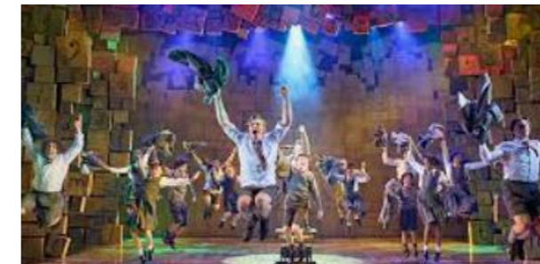
Matilda (Book Musical)