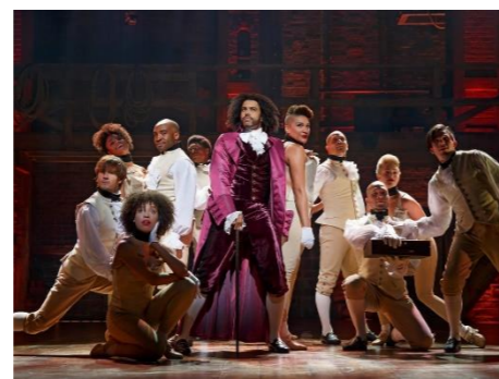
Hamilton (hip hop)