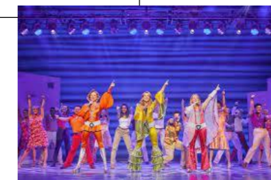
Dancing Queen (ABBA jukebox)