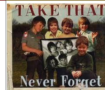
Never forget - Take That