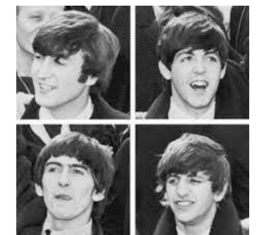
With a little help from my friends - The Beatles