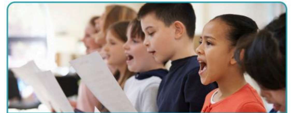
Exploring pop songs about new beginnings. Pop music is short for 'popular music' and this style of music generally has a simple, memorable melody.