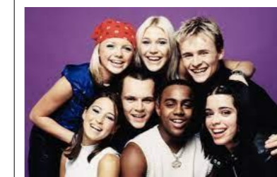
Reach - S Club 7