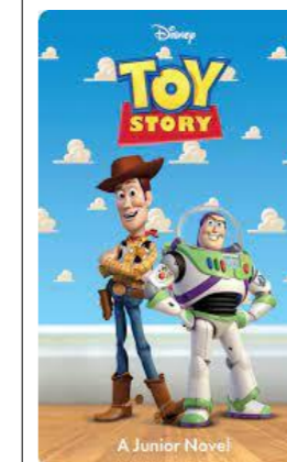
You've got a friend in me - Randy Newman, Toy Story